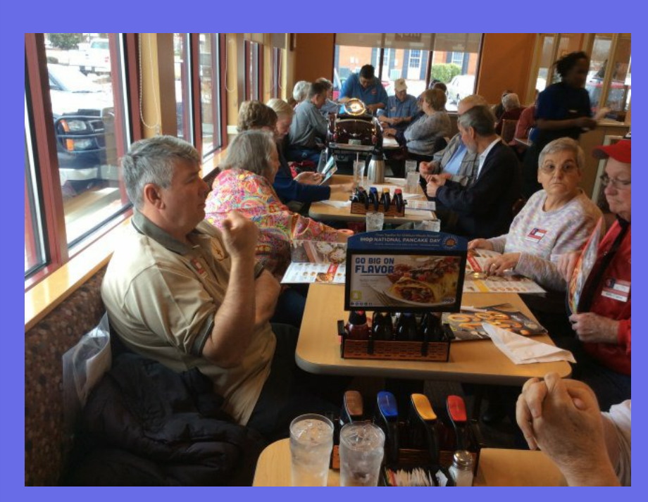
Some of the attendees