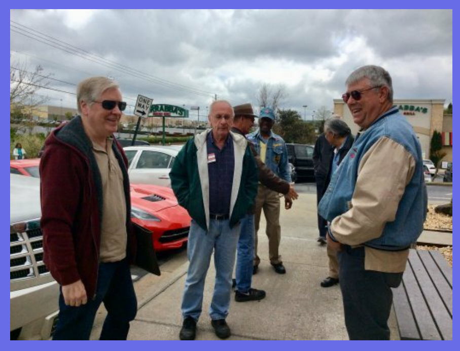
Some folks gathered outside TGI Fridays (in Morrow) prior to the meeting.