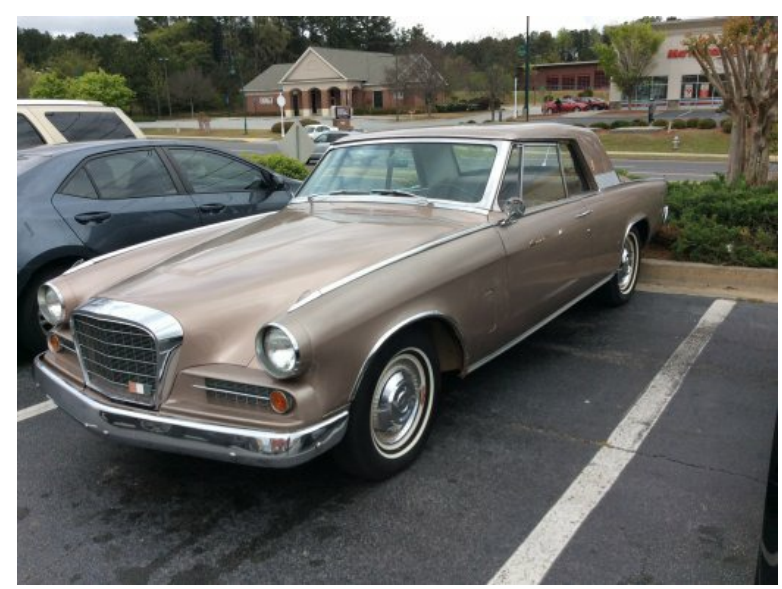
The only Studebaker driven to the meeting. Thanks for driving it, Pete.