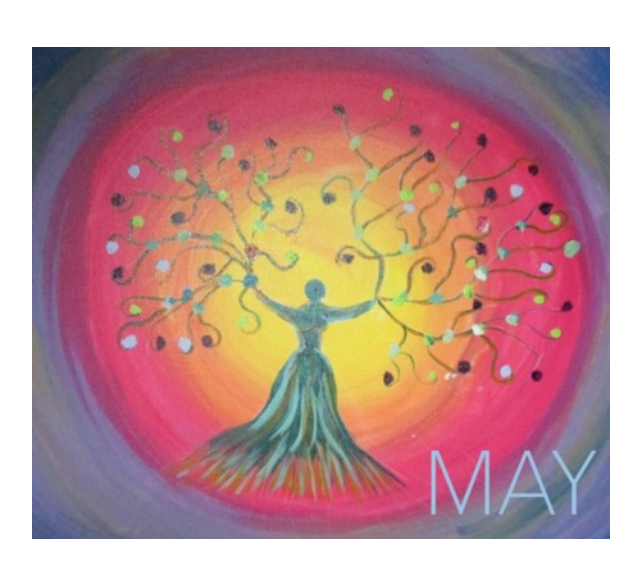
Acrylic painting by Guadalupe Taylor