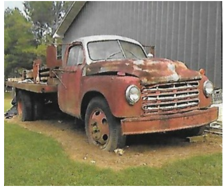
1950 farm truck dump bed.