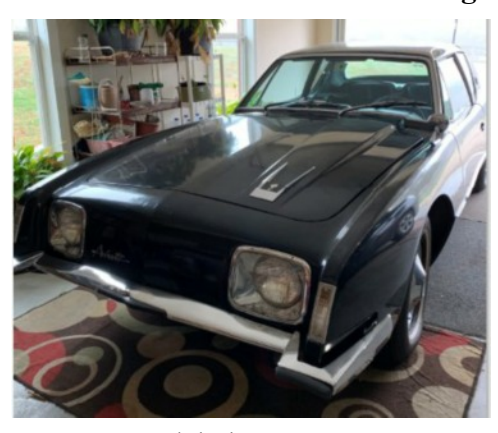
1964 Studebaker Avanti