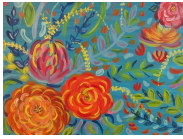
Acrylic painting by Guadalupe Taylor