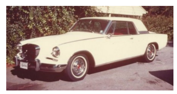
Continued on page 13