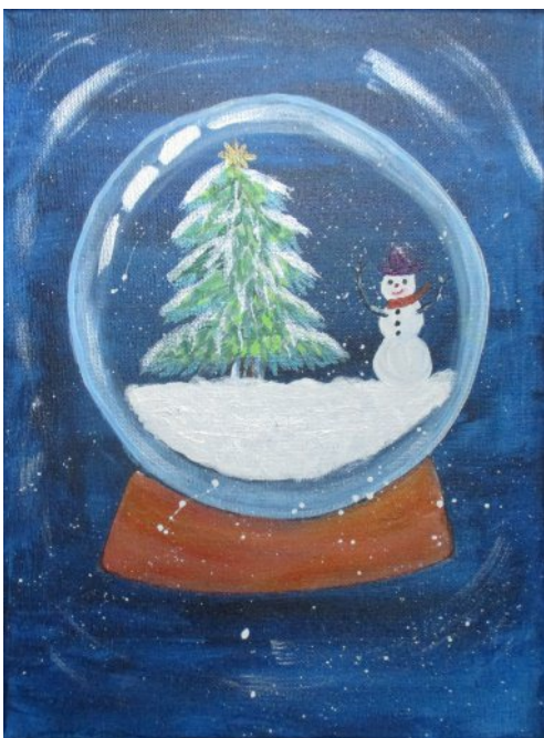
Acrylics on canvas By Guadalupe Taylor