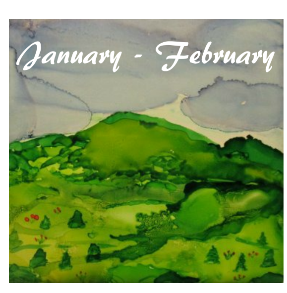
Alcohol ink on ceramic tile By Guadalupe Taylor