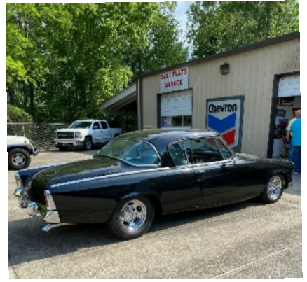
1953 Studebaker, 9" Ford Rear End, 350 Transmission, 355 ZZ4 motor, $25,000