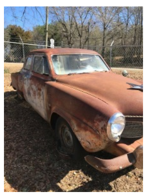
'51 V8 4-door

Sherman Woods, Sulligent, Alabama, has three Studebaker project cars for sale at $5000.00 for all three. First is a '51 V8 4-door solid body, bad paint but very complete except for missing "bullet" nose. Second is a '63 Lark 6-cylinder, 4-door, very complete. Third is a '62 Grand Turismo body only, no control arms and no hood. Interested parties can reach Mr. Woods at 205-698-9921 or shermanw@centurytel.net