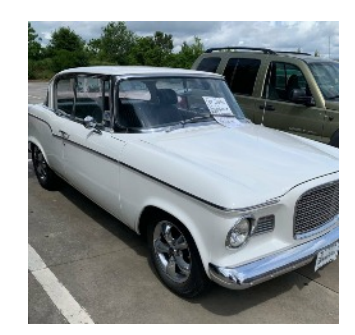
1959 Lark 2 door hardtop

Chevy 350, TH 700R4, much new chrome, new paint, air, PS, PB (disc). Call George Gratton at 912 433 3330 or email ggratton@gmail.com. $15,900. or offer? 5/27/19