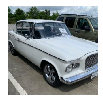
1959 Lark 2 door hardtop

Chevy 350, TH 700R4, much new chrome, new paint, air, PS, PB (disc). Call George Gratton at 912 433 3330 or email ggratton@gmail.com. $15,900. or offer? 5/27/19