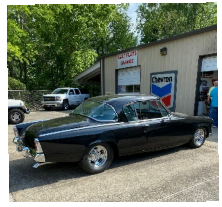
1953 Studebaker, 9" Ford Rear End, 350 Transmission, 355 ZZ4 motor, $25,000