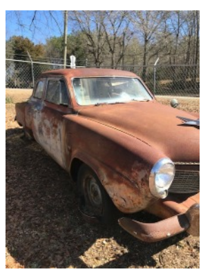
'51 V8 4-door

Sherman Woods, Sulligent, Alabama, has three Studebaker project cars for sale at $5000.00 for all three. First is a '51 V8 4-door solid body, bad paint but very complete except for missing "bullet" nose. Second is a '63 Lark 6-cylinder, 4-door, very complete. Third is a '62 Grand Turismo body only, no control arms and no hood. Interested parties can reach Mr. Woods at 205-698-9921 or shermanw@centurytel.net