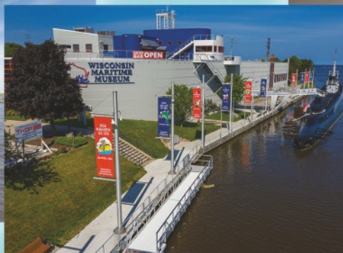
Wisconsin Maritime Museum featuring submarine USS Cobia