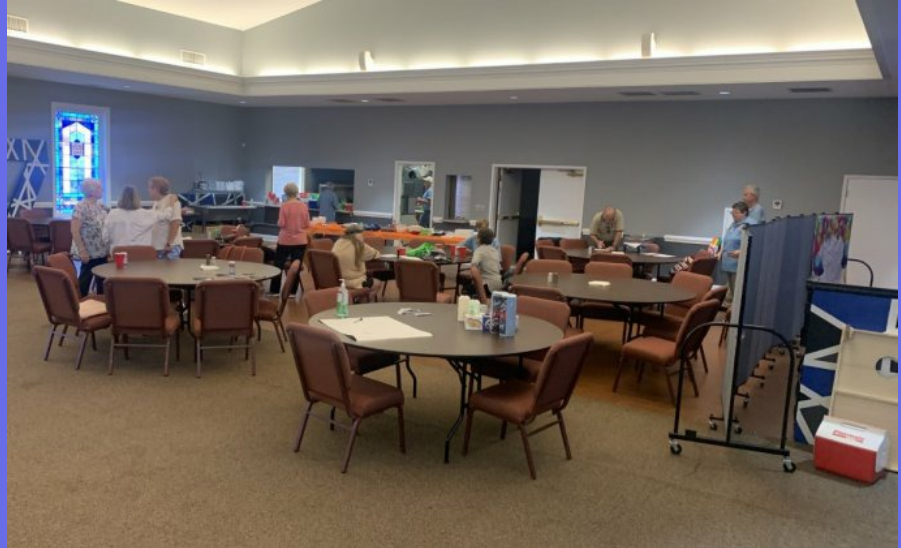
The meeting took place at the Bethlehem United Methodist Church in Bethlehem, GA.

Our next and final meeting for 2022 will take place on Sunday, December 4, at Forsyth County Senior Services at Charles Place in Cumming. See details on page 7.