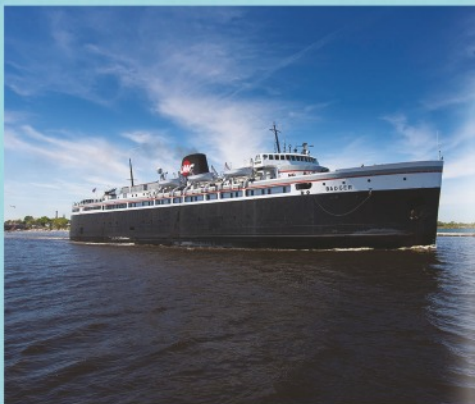
Lake Michigan Car Ferry Ludington, Mich. to Manitowoc, Wis.

Northeast Wisconsin is a beautiful place in late summer - and the Wisconsin Region Studebaker Drivers Club will have a wide range of great activities planned for the 59th SDC International Meet, Stay tuned for more details! We'll see you there!