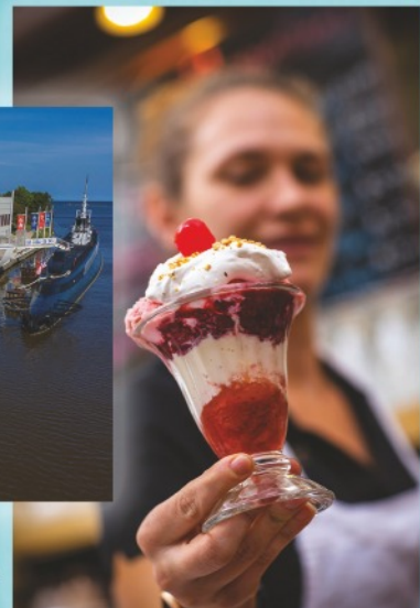
Two Rivers, Wis. Home of the Ice Cream Sundae

Enjoy the hospitality of our friendly community.