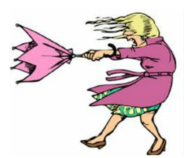
March winds, April showers

Our next meeting for 2023 will take place on Sunday, April 2, at Provino's Italian Restaurant in Kennesaw. See details on page 8.