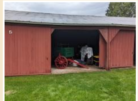
Wagon's new home, Dickson-Murst Farm