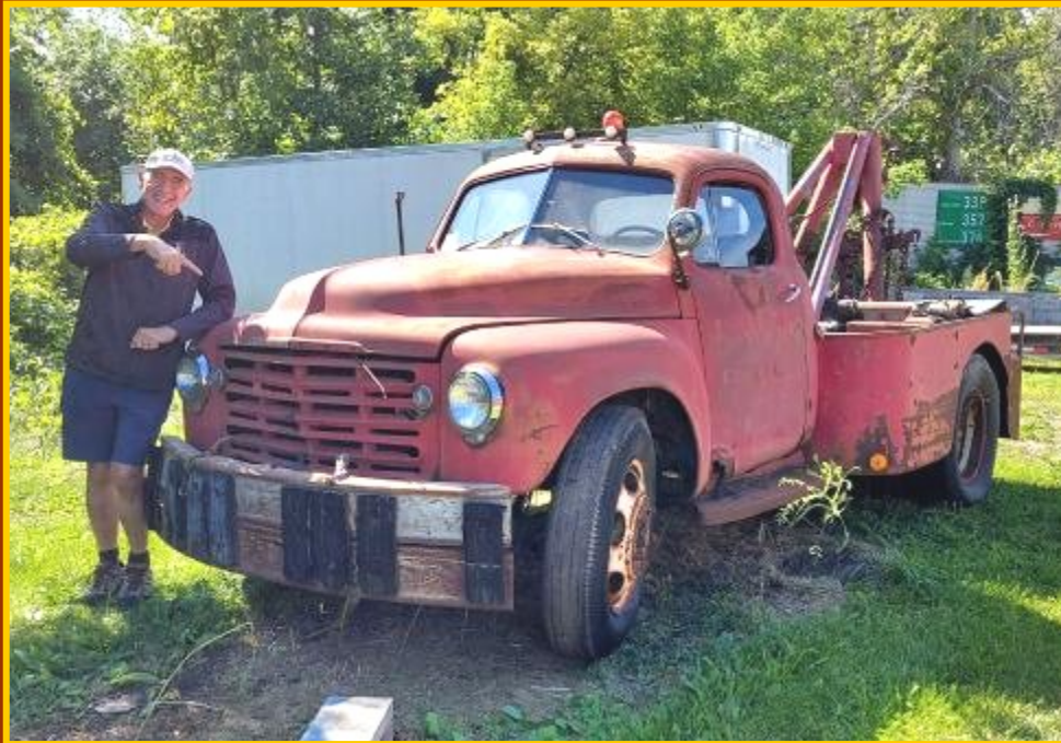
Your Editor and a Gem of a Studebaker Tow Truck - Wrecker (just looking not buying)