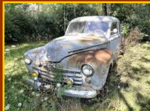
1947-1948 Ford 2-Door Sedan