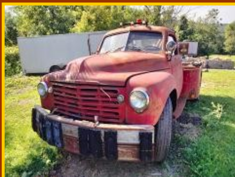
Early 1950's Studebaker R Series Tow-Truck