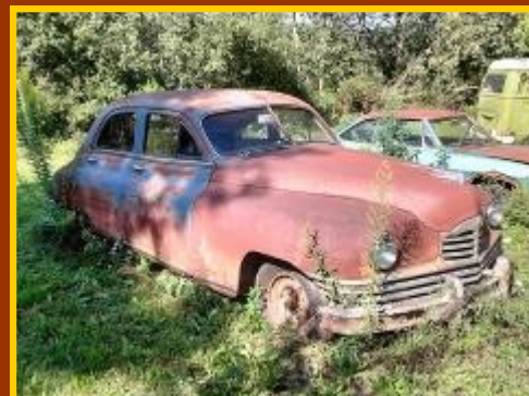
1948 Packard 4-Door Sedan