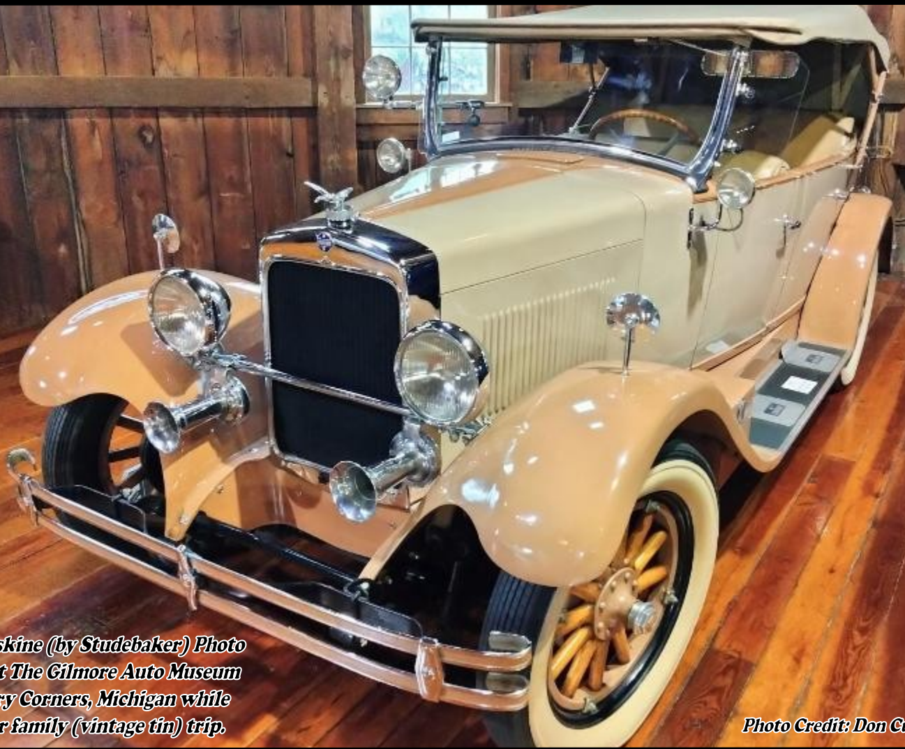
1928 Erskine (by Studebaker) Photo taken at The Gilmore Auto Museum Hickory Corners, Michigan while on our family (vintage tin) trip.

There's Studebaker Tin "Up in Them Thar Hills" in Upstate NY.