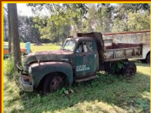
1953 Chevrolet Dump Truck