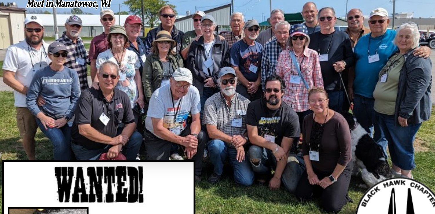
SDC Black Hawk Chapter Members Group Photo at 59th SDC International Meet in Manitowoc, WI