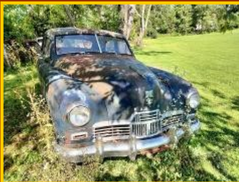
1947 Kaiser of Kaiser Frazer Corporation