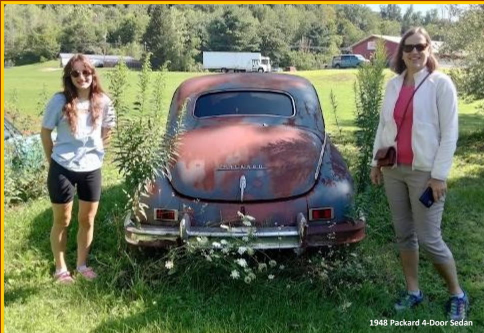
1948 Packard 4-Door Sedan