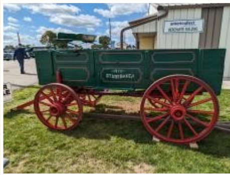
1914 Studebaker Farm Wagon