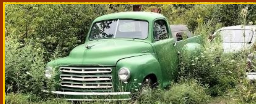
Early 1950's Stude R-Series Pickup Truck at Joe Allen's in Trumansburg, NY