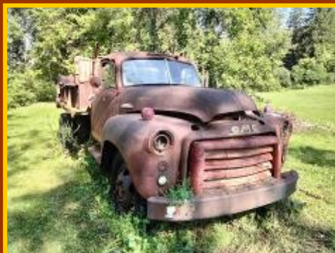
1950-1953 GMC Dump Truck