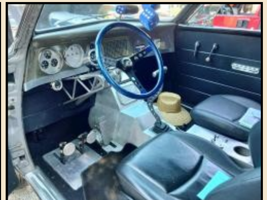
These '52 STUDE GASSER photos were taken at the Maple Park Fun Fest Car Show in Maple Park, Illinois held on September 3rd 2023.