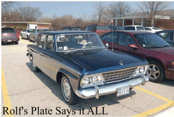
Rolf's Plate Says it ALL