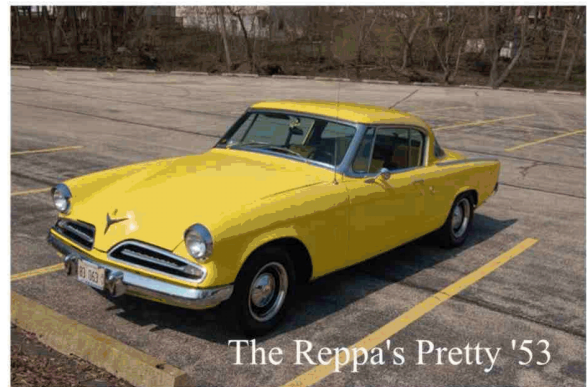
The Reppa's Pretty '53